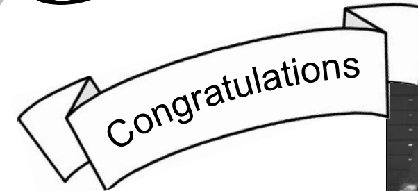
2003-04 Division II Boys Basketball State Champions